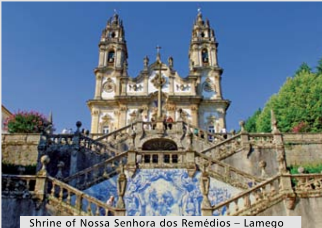
Shrine of Nossa Senhora dos Remédios – Lamego