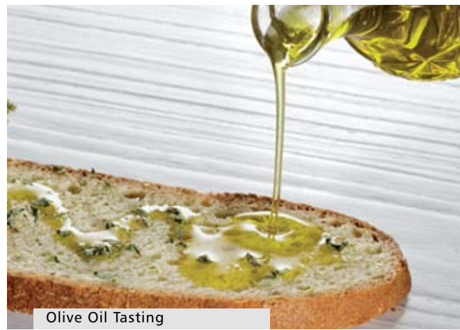
Olive Oil Tasting

Daily life hasn't suffered many changes for centuries and these isolated towns own a very own rustic beauty. The inhabitants have a traditional way of life, especially in smaller cities and towns, like Miranda do Douro, with special traditions like the Mirandês dialect, Mogadouro, Torre de Moncorvo and Freixo de Espada à Cinta.