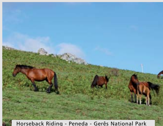
Horseback Riding - Peneda - Gerês National Park