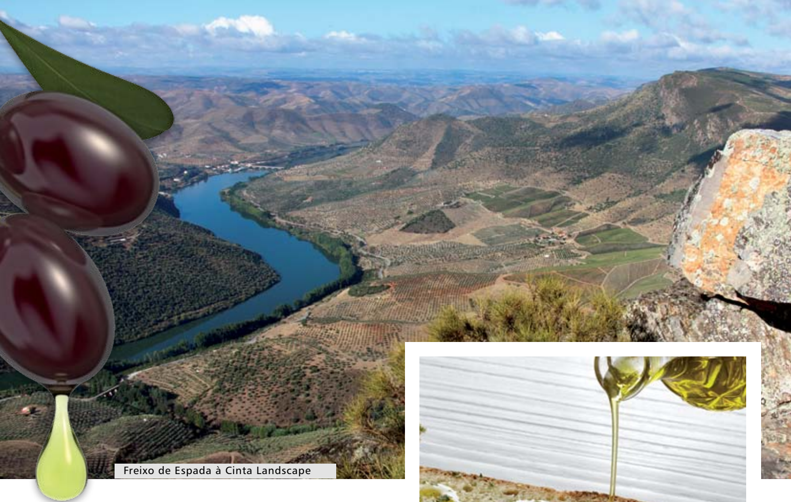
Freixo de Espada à Cinta Landscape