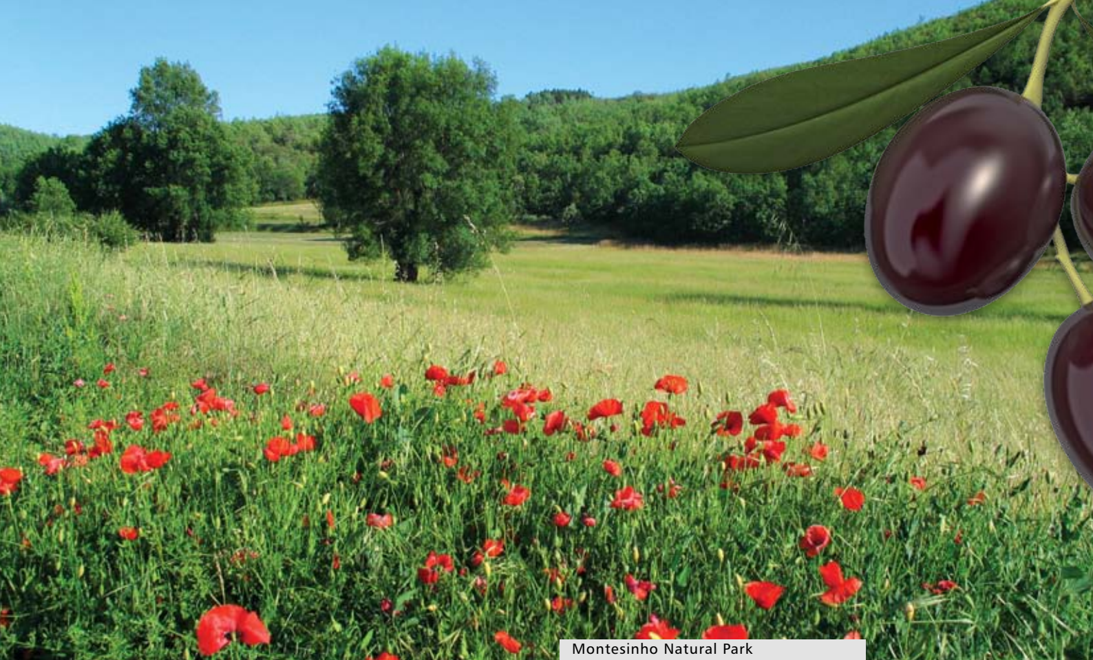
Montesinho Natural Park