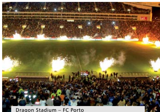
Dragon Stadium – FC Porto

The Casa da Música, the Historical Centre and the Ribeira Square, the Lello Bookshop, the Café Majestic, the Port Wine Cellars and the Monastery of Nossa Senhora do Pilar, the Guindais Funicular, Miguel Bombarda Street, Galeria de Paris Street, Cândido dos Reis Street, Serralves House and Museum of Modern Art, the São Bento Train station, the Cathedral, the Clérigos Tower. And, of course, the contagious joy of the popular festivities, the excellent gastronomy and the wine.