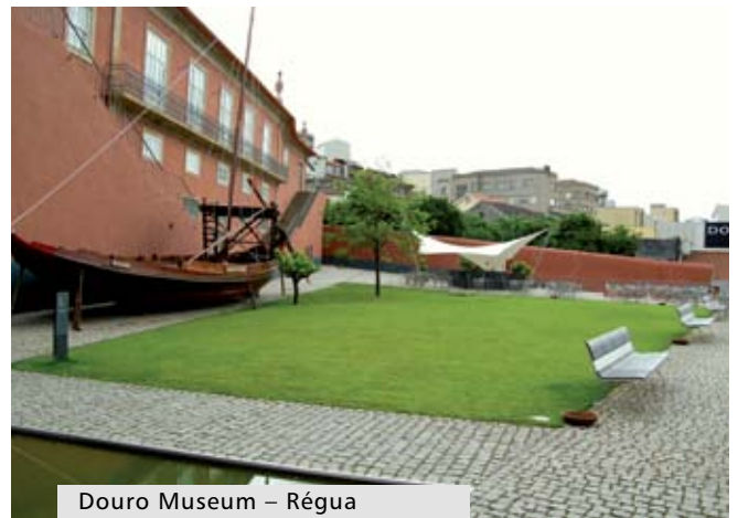
Douro Museum – Régua

The River Douro flows from the Spanish border to the east of Porto and, depending on the time of the year, its slopes may be decorated with Almond trees and Cherry blossom or with the harvest labor.