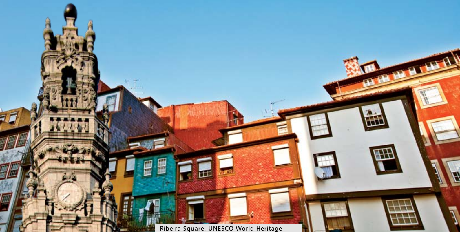
Ribeira Square, UNESCO World Heritage