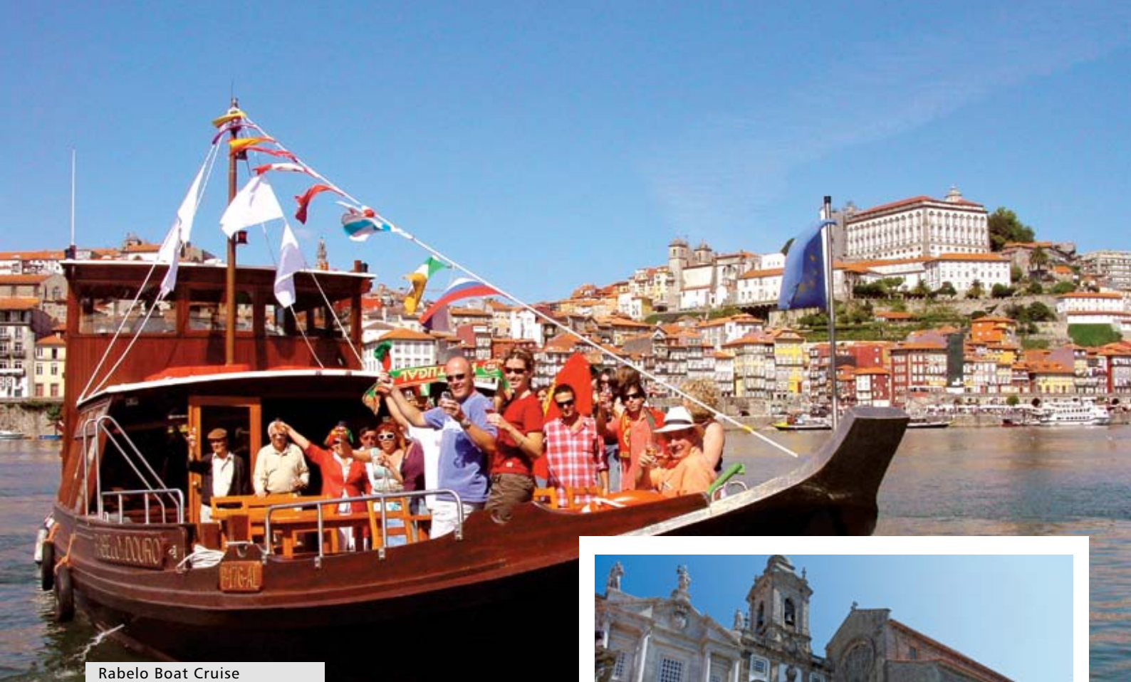
Rabelo Boat Cruise