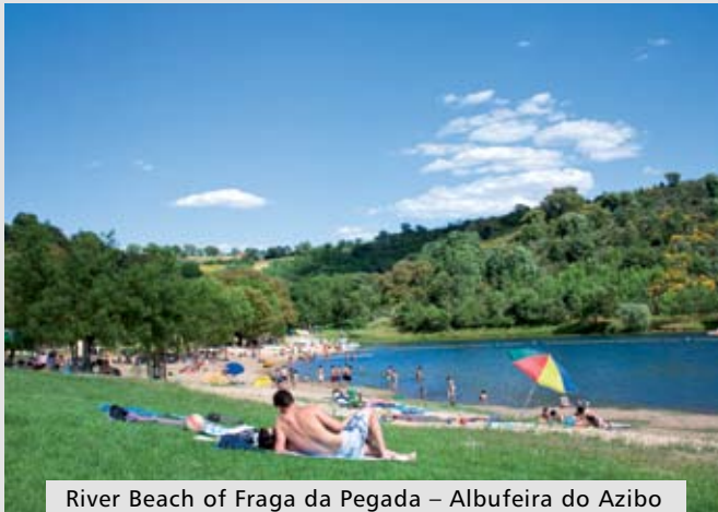
River Beach of Fraga da Pegada – Albufeira do Azibo