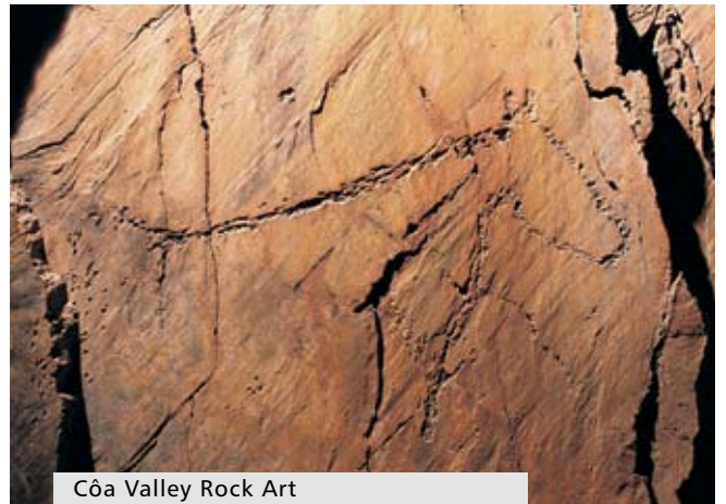
Côa Valley Rock Art

The Rock Art of Côa Valley and the Archeological Park, the Douro International Natural Park and the Alvão Natural Park, the Douro Valley, the Douro Museum, the Côa Museum, Monuments, the harvest, gastronomy and wine, the Douro cruises, the Casa de Mateus Foundation, the Monastery of Salzedas and the Shrine of Nossa Senhora dos Remédios.