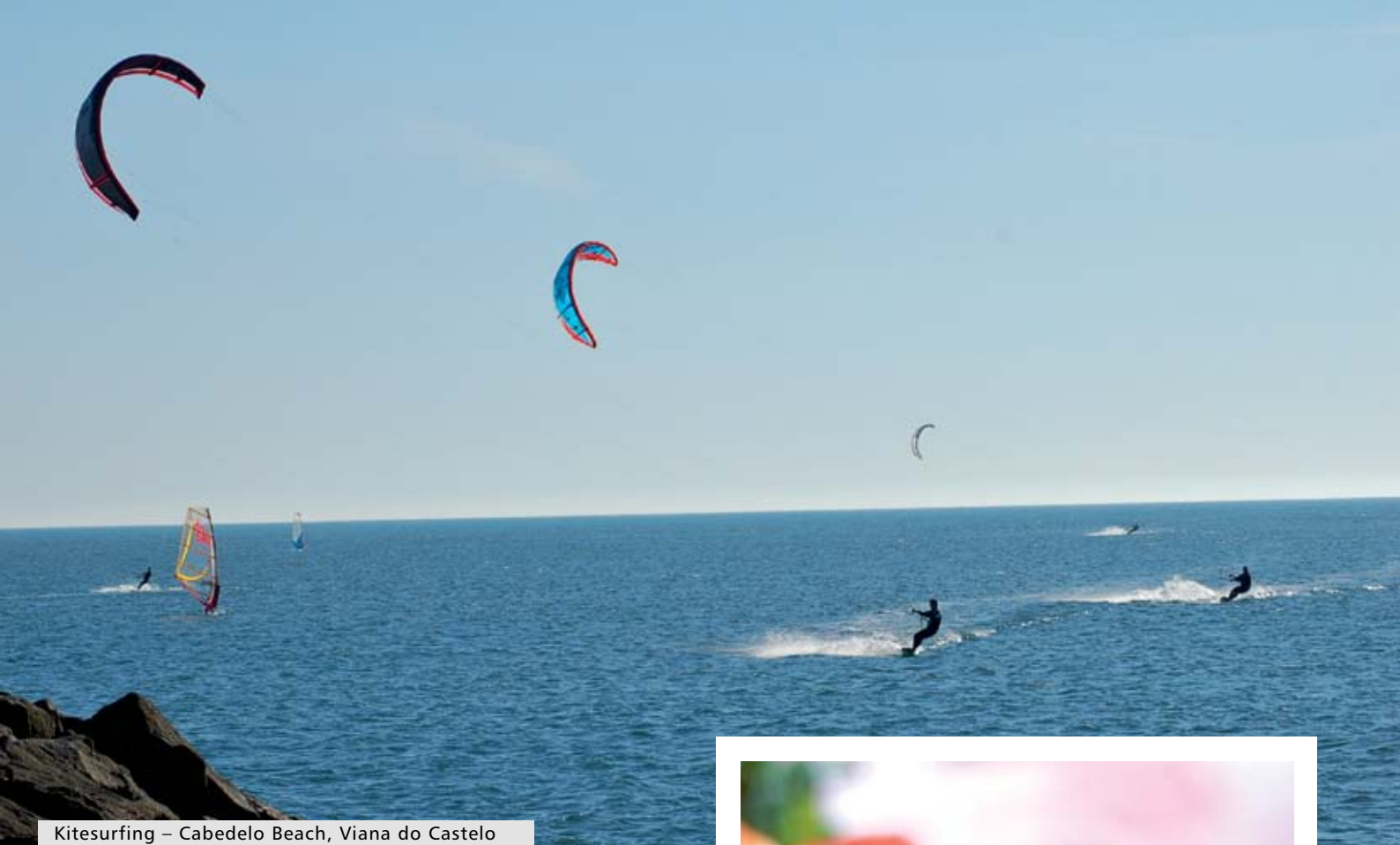
Kitesurfing – Cabedelo Beach, Viana do Castelo