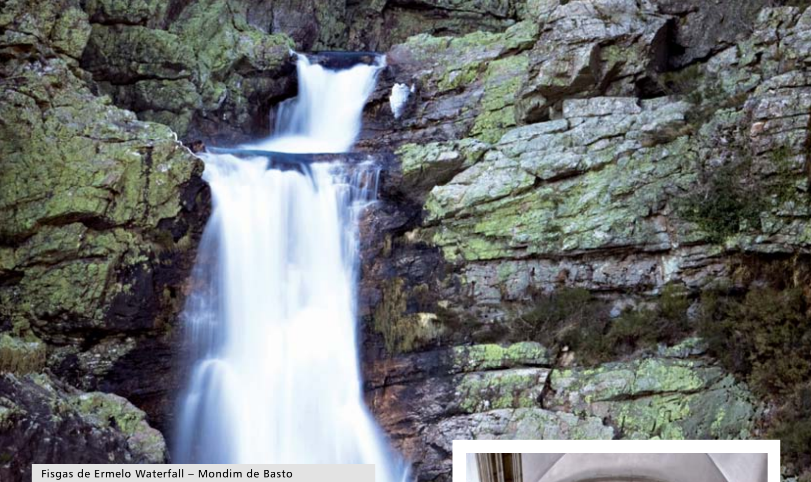
Fisgas de Ermelo Waterfall – Mondim de Basto