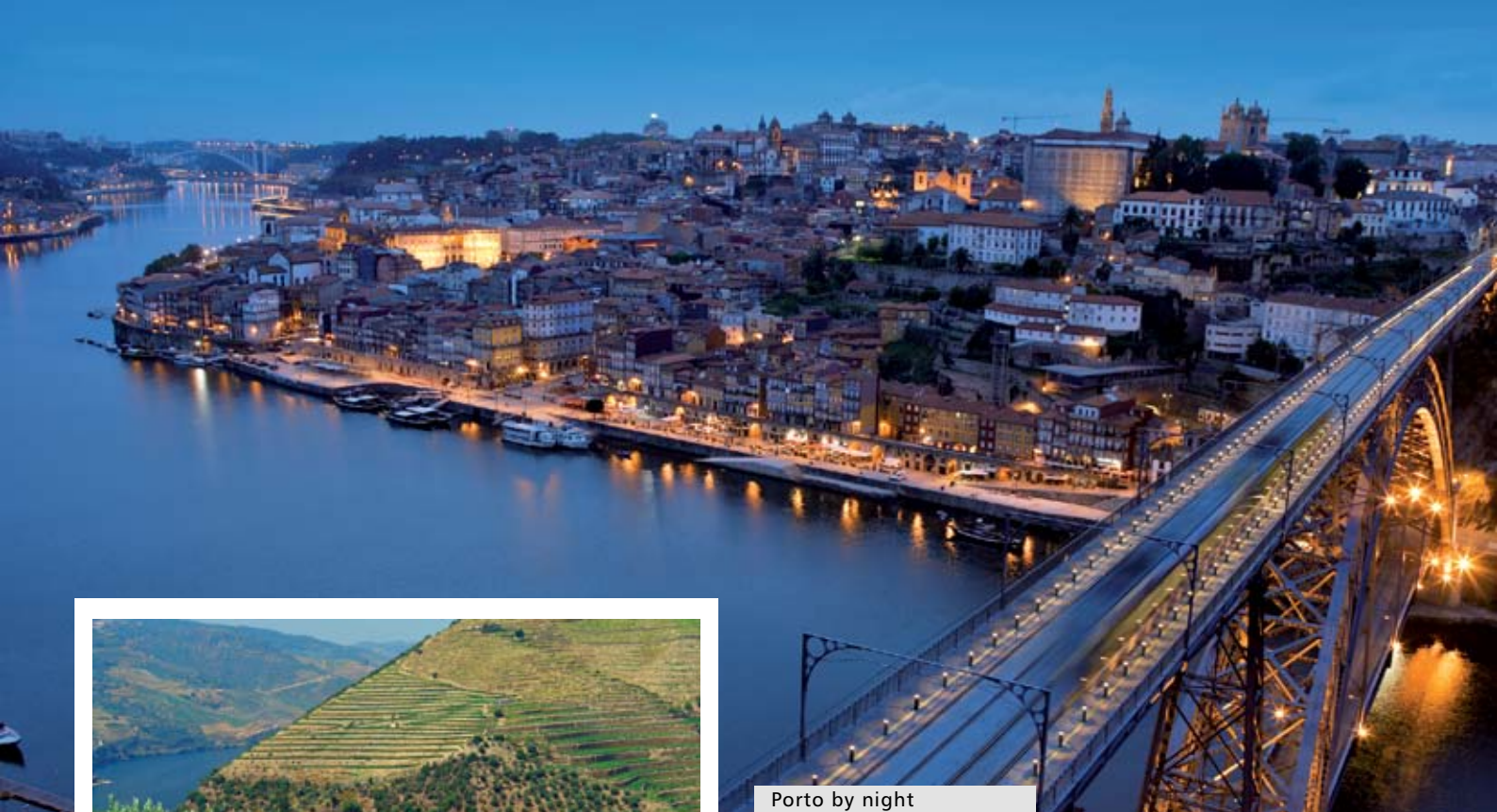
Porto by night