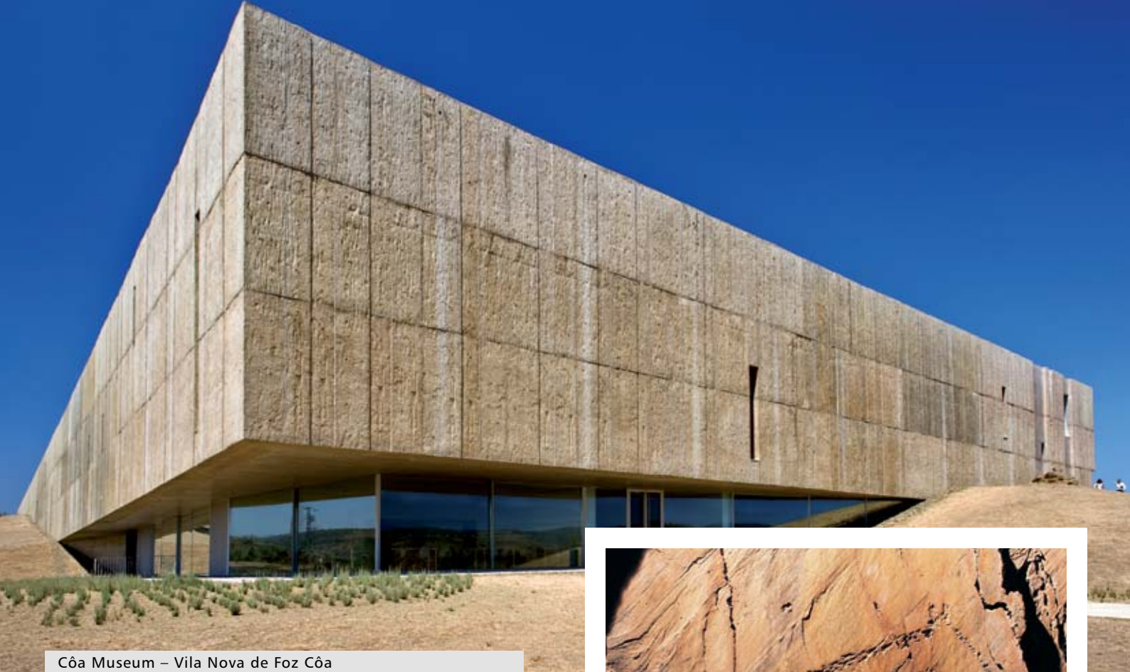
Côa Museum – Vila Nova de Foz Côa