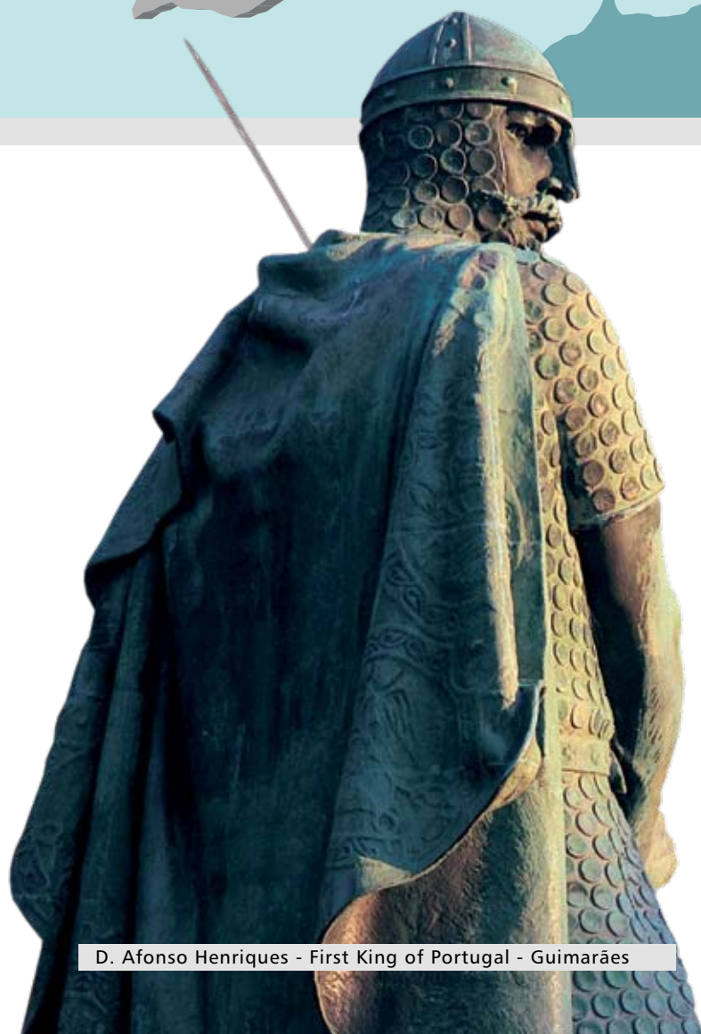
D. Afonso Henriques - First King of Portugal - Guimarães