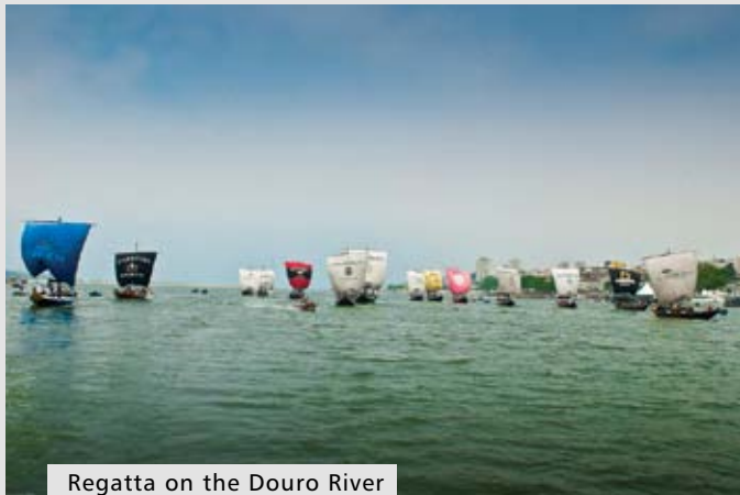
Regatta on the Douro River