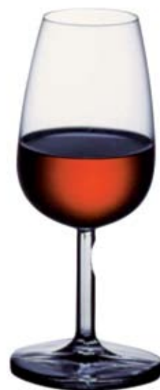
Official Port Wine Glass designed by Architect Siza Vieira

It is a unique experience to stroll through its streets and feel the pulse of the city. Take the tram to the mouth of the river Douro and get to know the excellent beaches and the outdoor cafés, visit admiring churches and monuments and encounter the non-