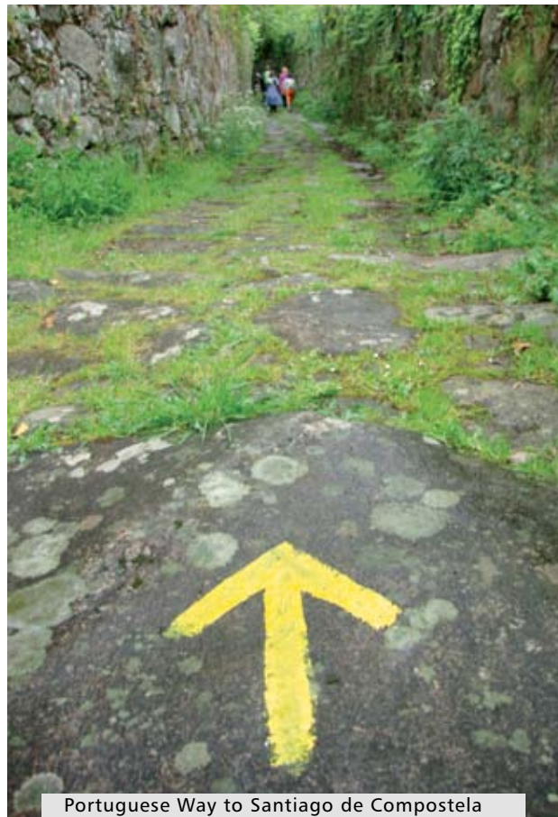
Portuguese Way to Santiago de Compostela