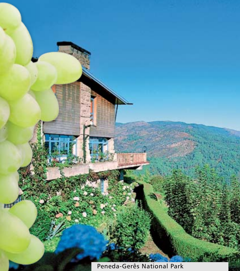
Peneda-Gerês National Park