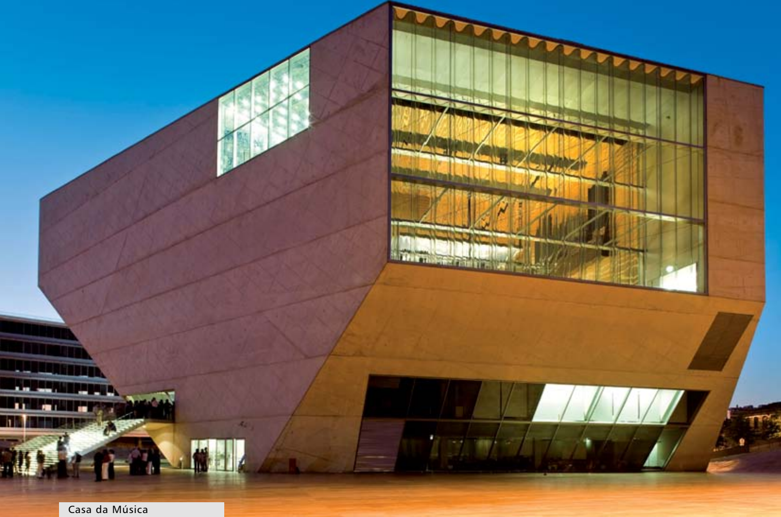
Casa da Música