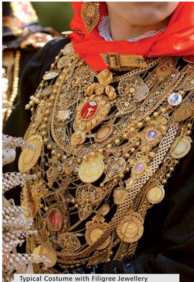
Typical Costume with Filigree Jewellery