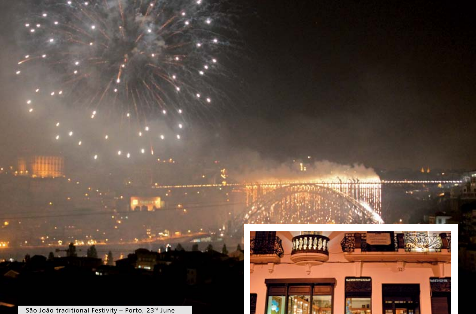
São João traditional Festivity – Porto, 23 rd June