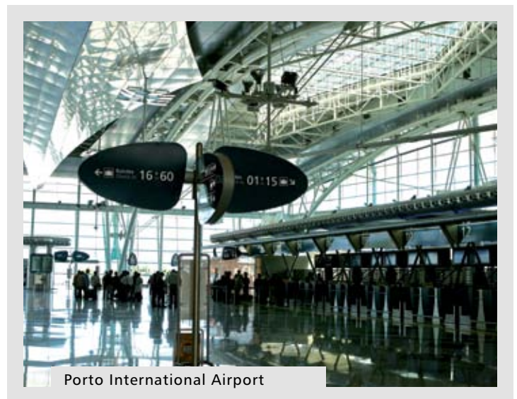
Porto International Airport

In Porto and in the North of Portugal, it is always possible to transform a simple transfer into an event and make it unforgettable, on board of a boat, tram or train.