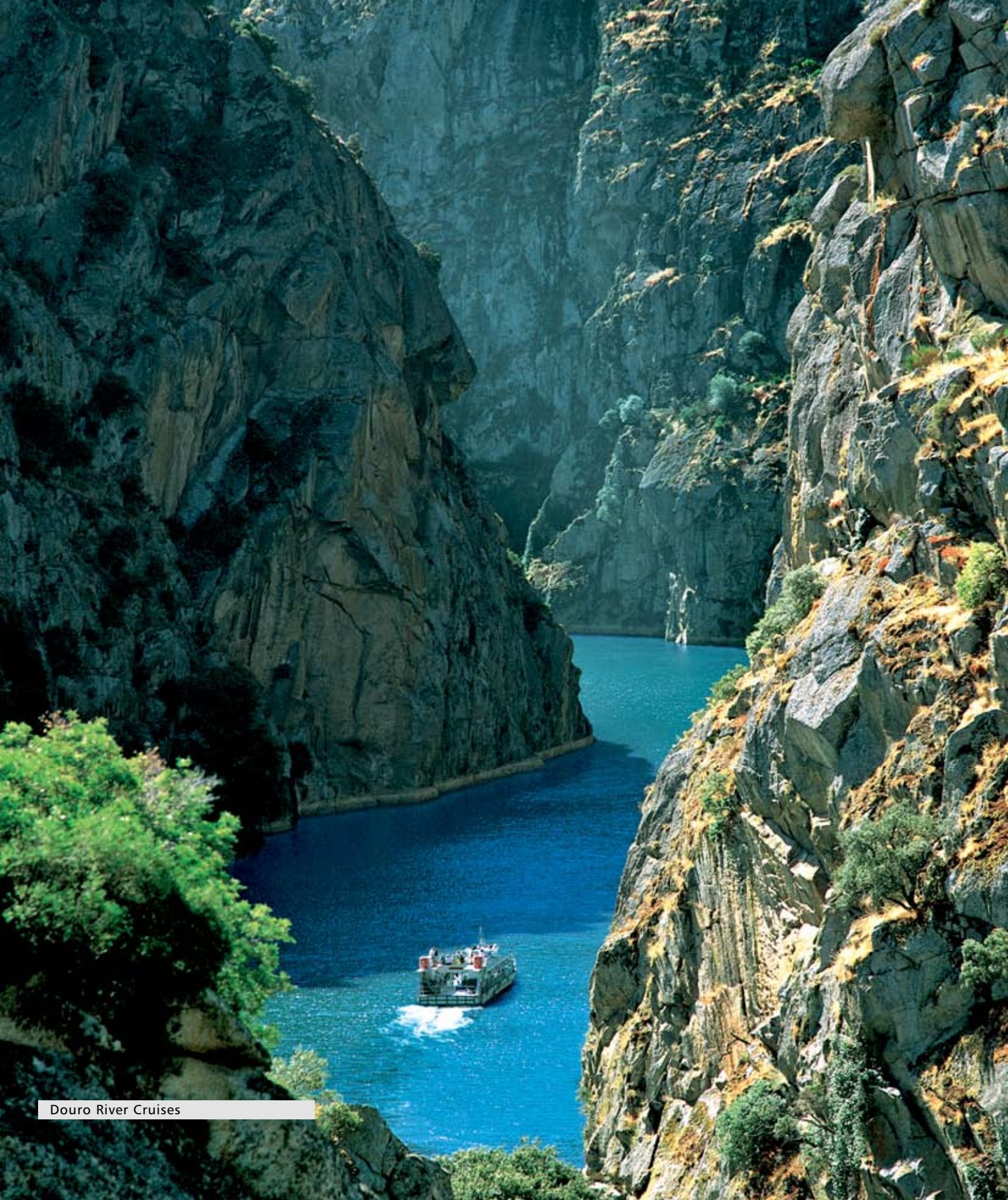
Douro River Cruises