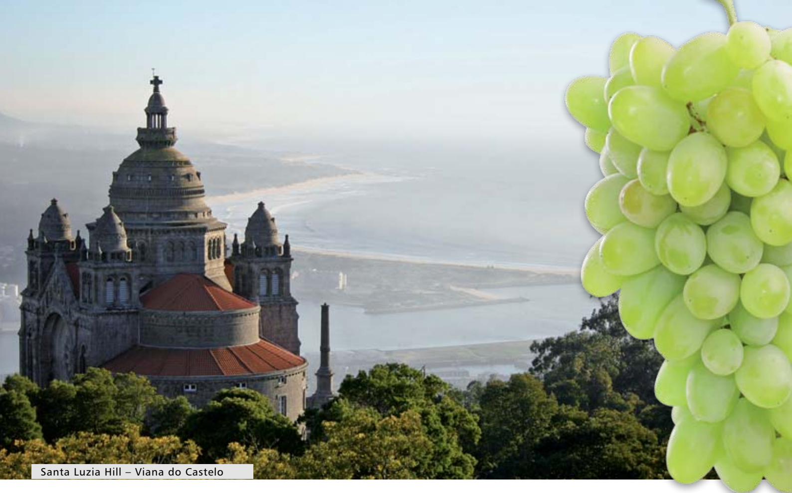
Santa Luzia Hill – Viana do Castelo