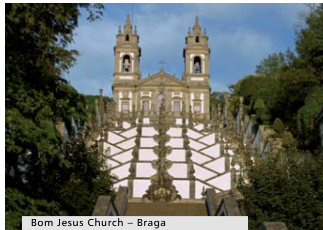
Bom Jesus Church – Braga

Visit churches and monuments of incomparable beauty, a rich popular culture, music, folklore, stories and an unparalleled handcraft. Know the Portuguese Way to Santiago, the way done by the pilgrims who flock to Santiago de Compostela, since the 9th century, through Minho.