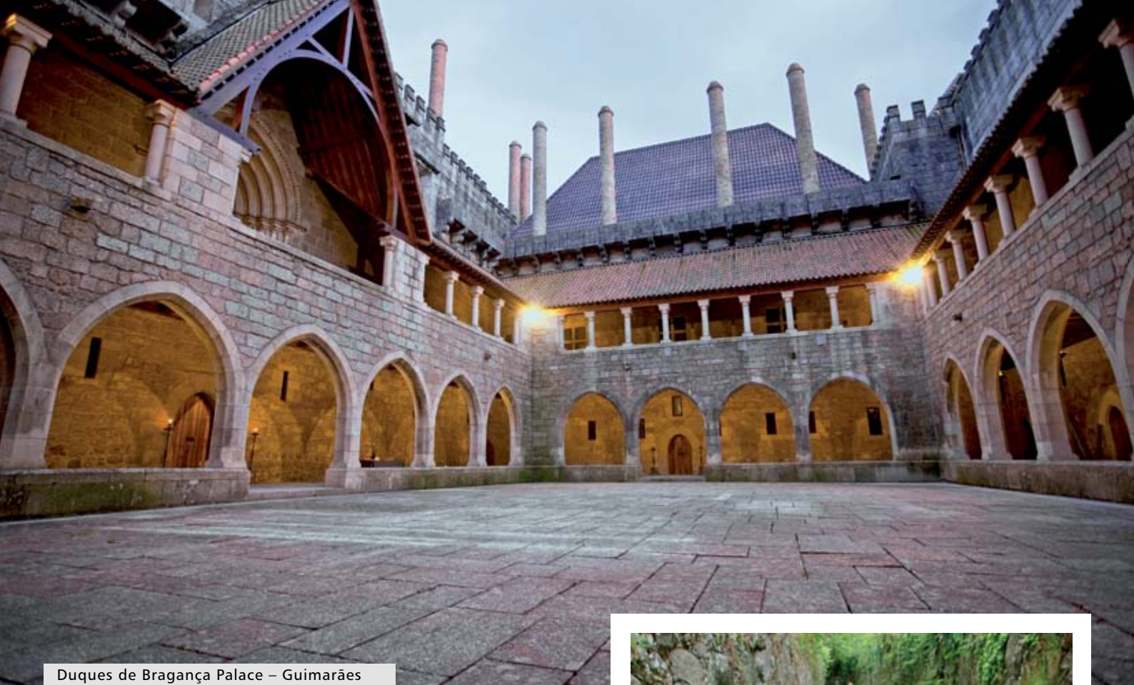
Duques de Bragança Palace – Guimarães