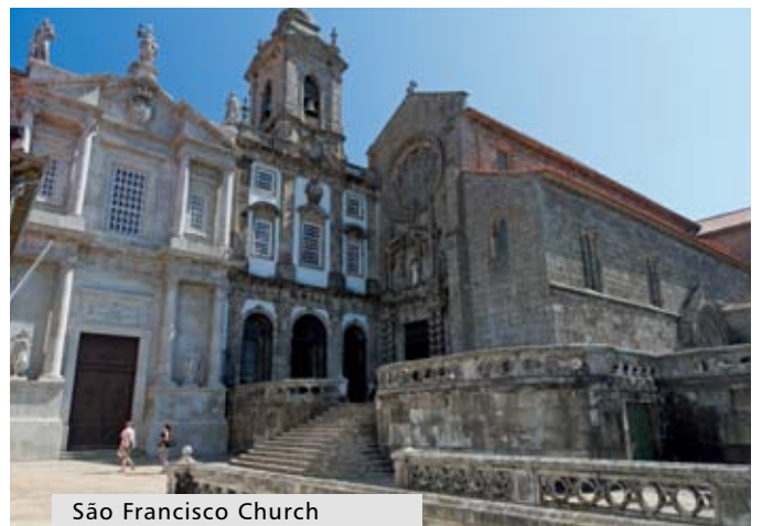
São Francisco Church