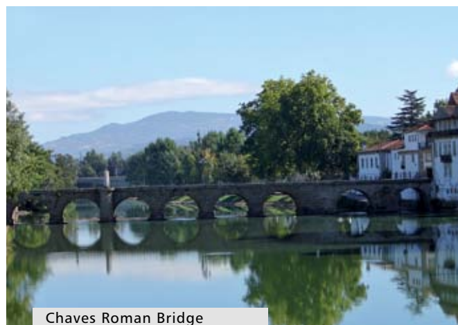
Chaves Roman Bridge

Trás-os-Montes is a very rich and peculiar area concerning gastronomy and traditions, highlighting the olive oil of great quality and the "Alheira", a very typical and very much appreciated sausage. The Carnival celebrations in Trás-os-Montes are vibrant and full of tradition. The festivities take up to the days before Ash Wednesday, and include eye-catching costumes, cheerful parades and traditional music, attracting visitors from all over the world. Revigorating spas and wild nature are attributes of a very preserved area, owner of an admirable beauty.