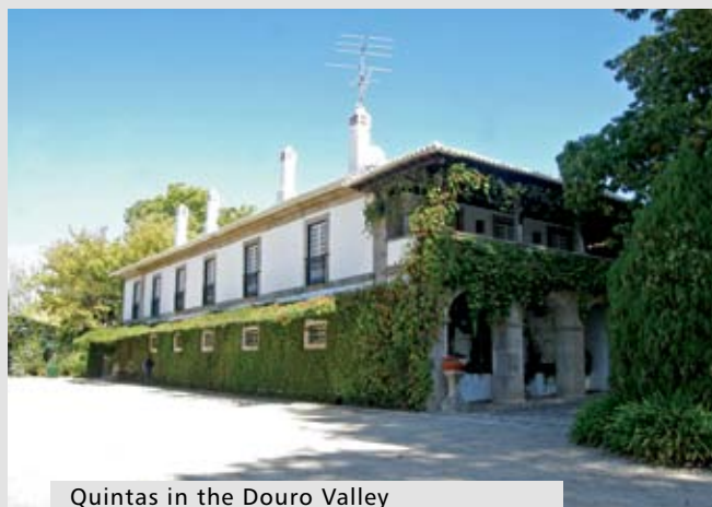
Quintas in the Douro Valley