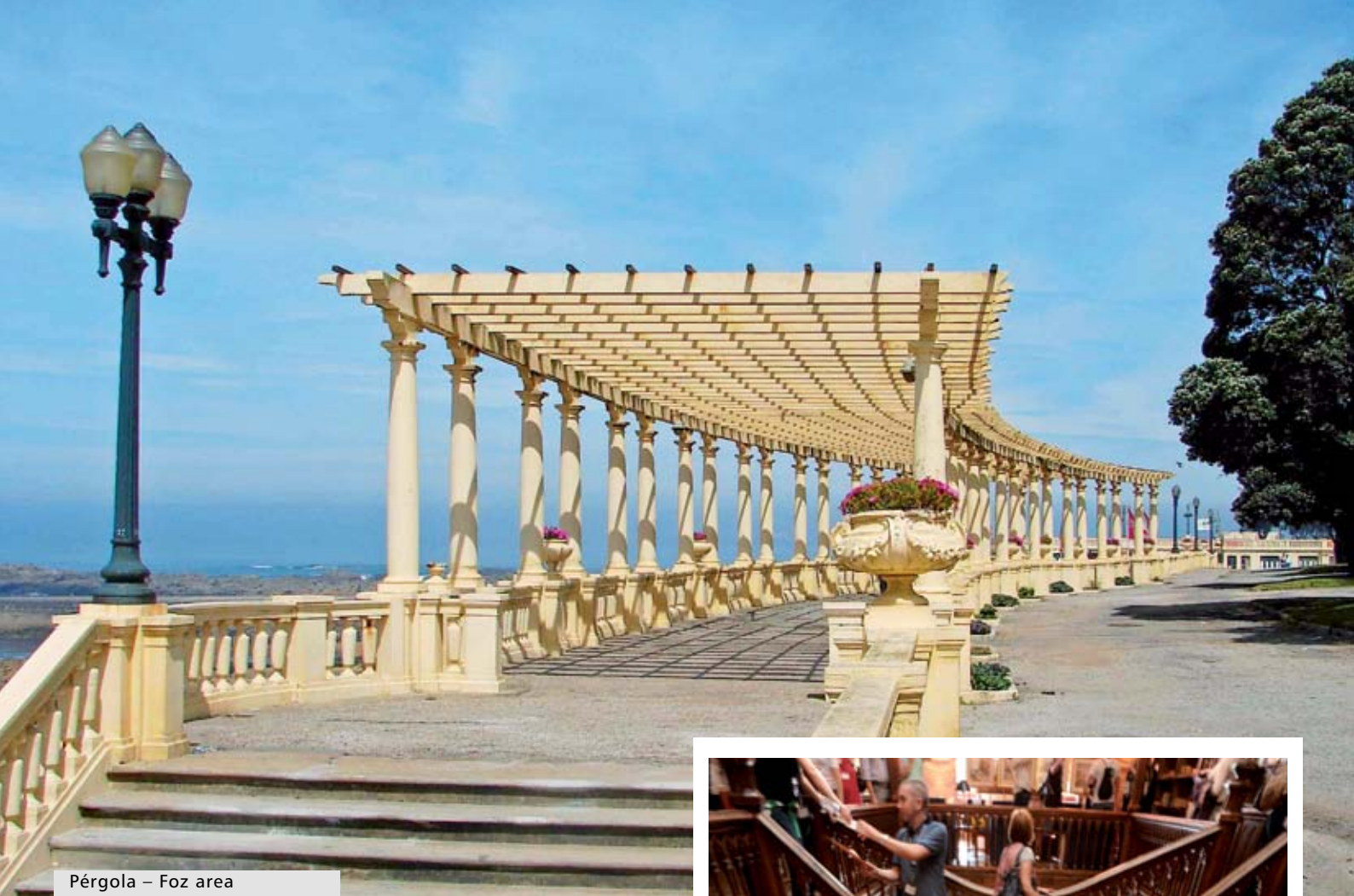
Pérgola – Foz area