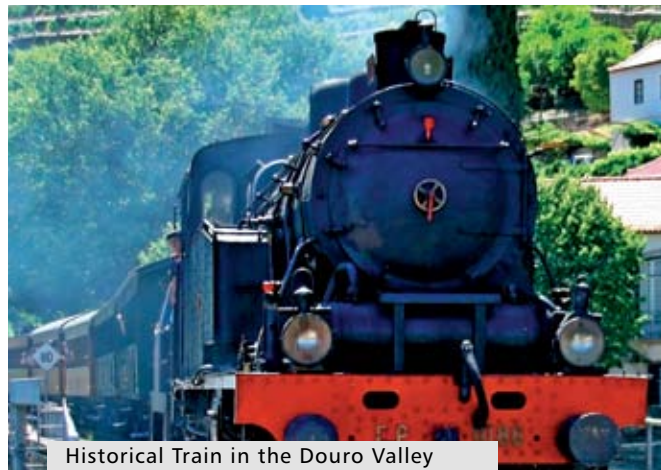
Historical Train in the Douro Valley

Participate in the harvest, treading and other popular events. Board on a cruise or travel by train to enjoy a unique landscape or, if you are looking for radical activities, there is a variety of water sports you can practise.