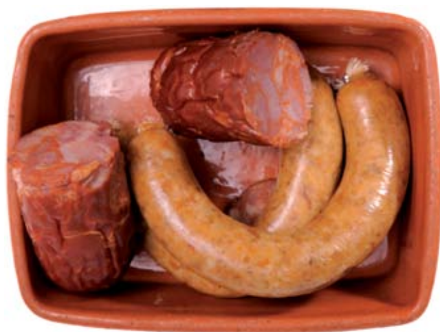
Traditional Sausages of Mirandela