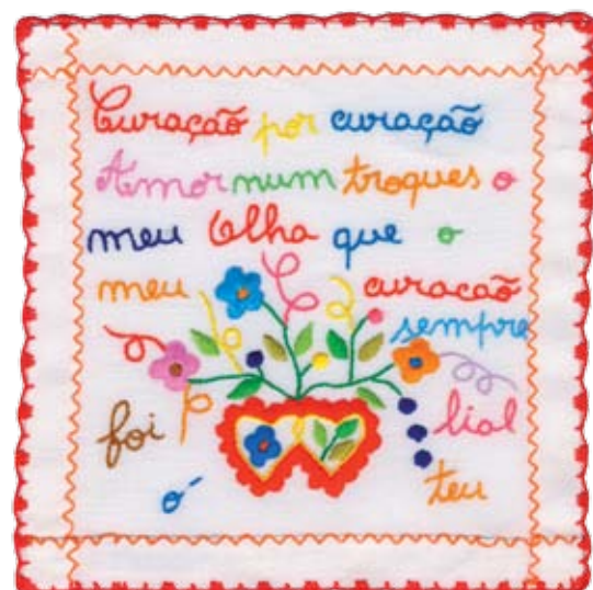
Handmade Valentine's Handkerchief - Vila Verde