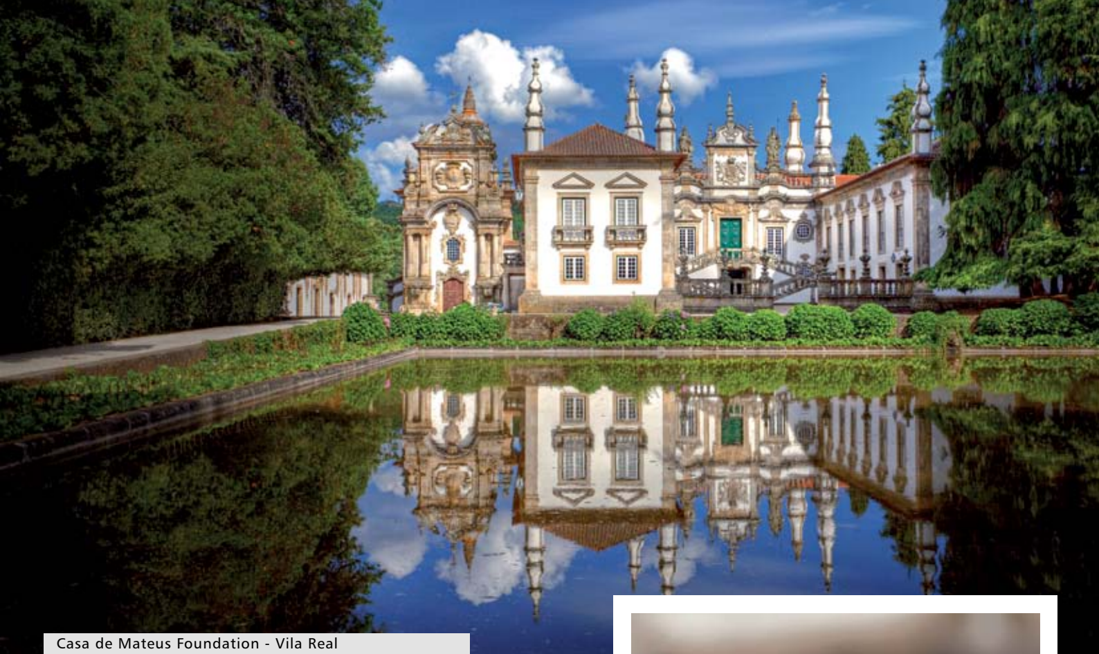
Casa de Mateus Foundation - Vila Real