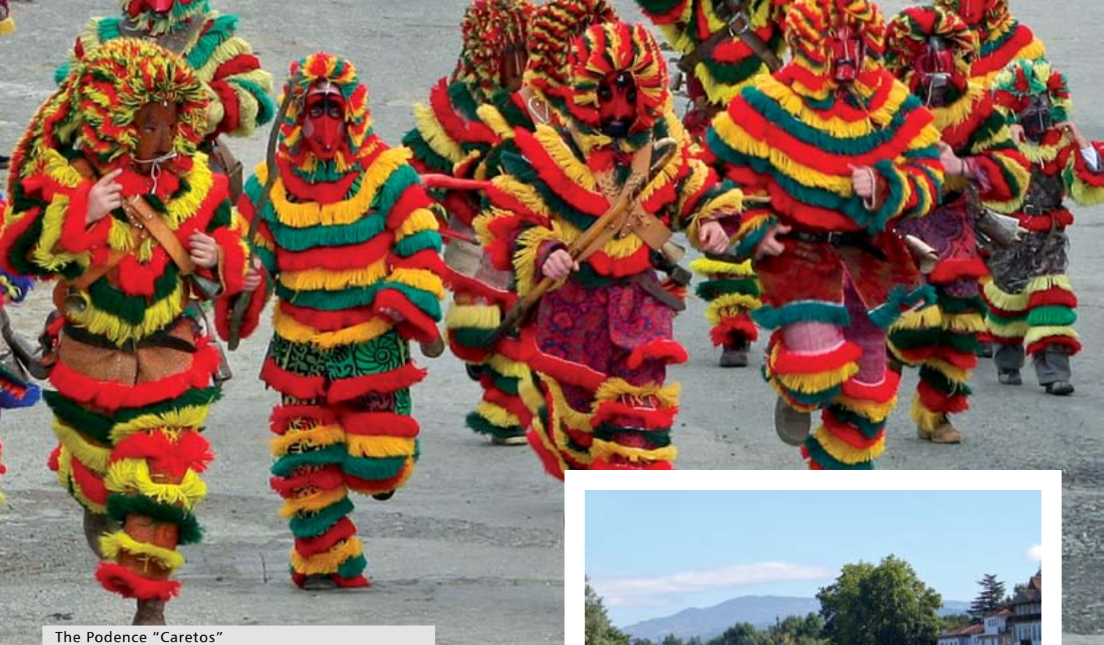
The Podence "Caretos"