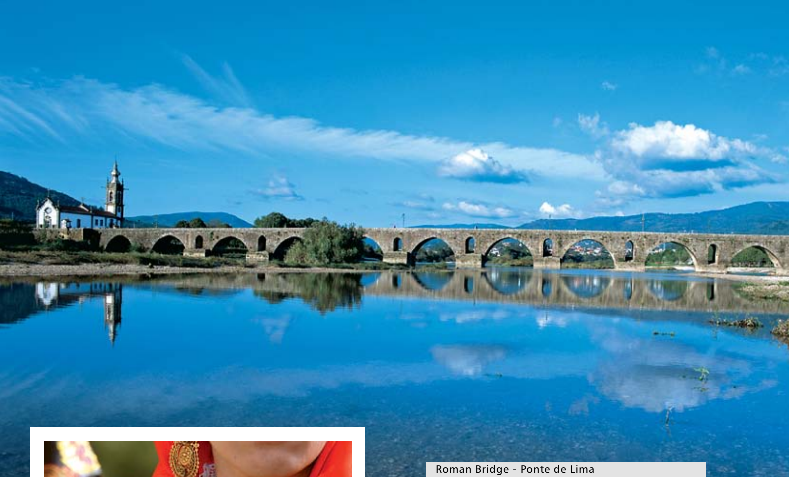
Roman Bridge - Ponte de Lima