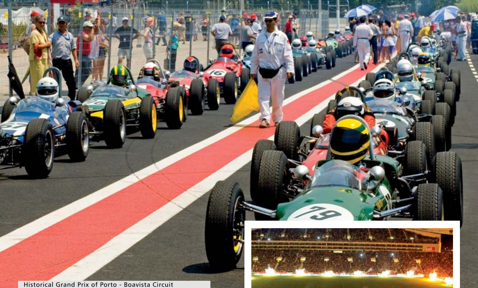
Historical Grand Prix of Porto - Boavista Circuit