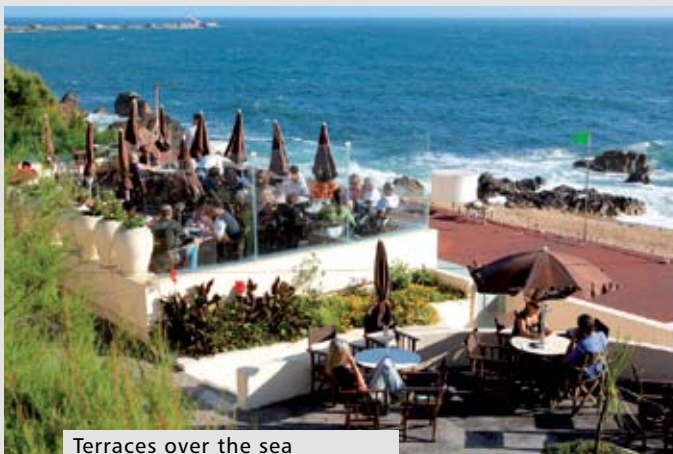
Terraces over the sea