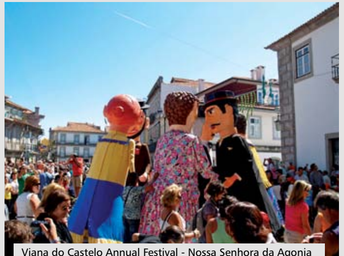
Viana do Castelo Annual Festival - Nossa Senhora da Agonia