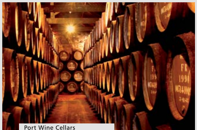
Port Wine Cellars