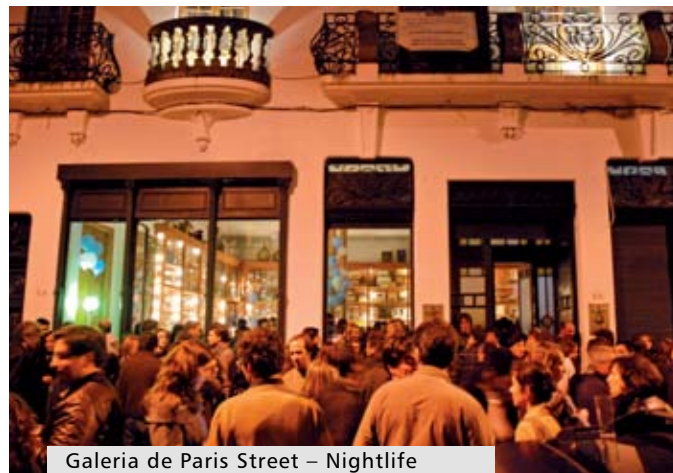
Galeria de Paris Street – Nightlife