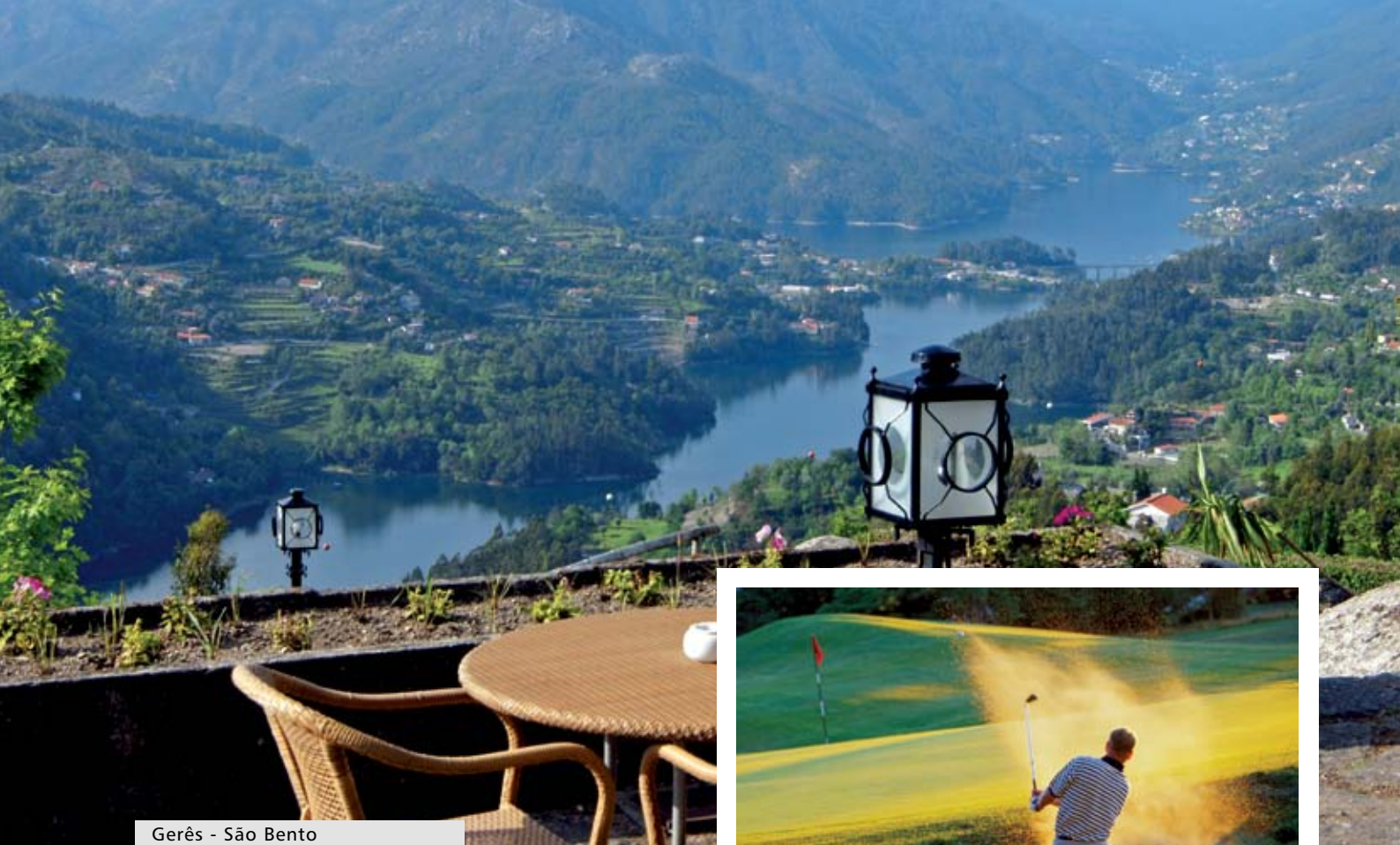
Gerês - São Bento