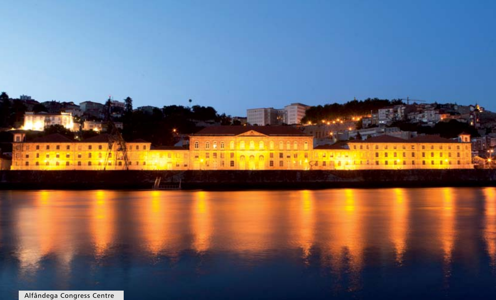
Alfândega Congress Centre