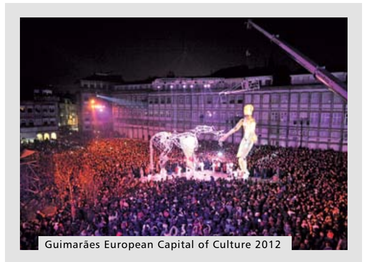
Guimarães European Capital of Culture 2012